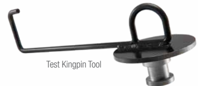
Test Kingpin Tool