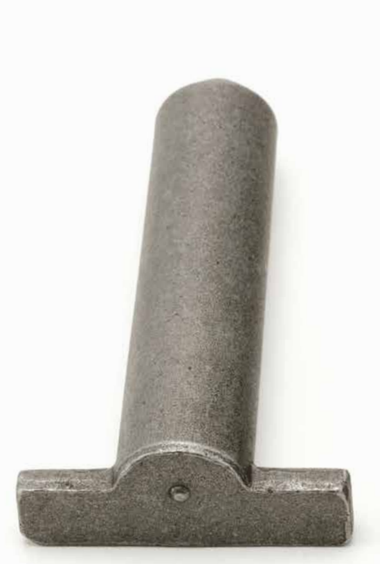
No-Slack® & No-Slack® Pin Order: KIT-PIN-191P 1 piece construction

The 3000 Series pin (bottom right) is two piece construction and welded at the head of the pin. The part number for the 3000 bracket pin is PIN-3000. This new pin is offered in a kit form – part # is KIT-PIN-3000.