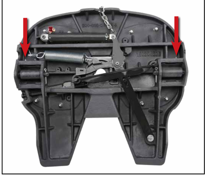
Figure 2: Underside view, Lubrication points of Fontaine Armor