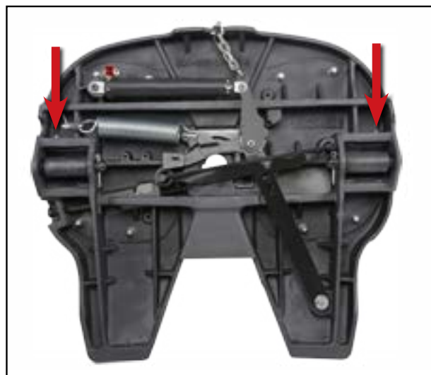
Figure 1: Underside view, Lubrication points of Fontaine Armor

Inspect the top surface of the fifth wheel to make sure it is properly greased. A liberal coating of grease