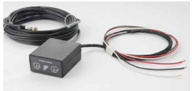
Figure 3: LST display box