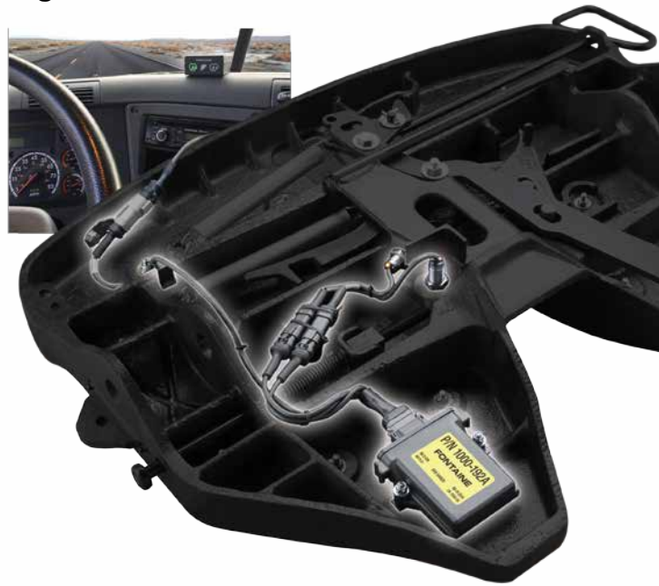
Figure 2: LST Fifth Wheel

Coupling display box with the 31 foot wire (display to fifth wheel connection), a 5.5" long M12 to 4 Pin Deutsch DT coupler cable is also included.